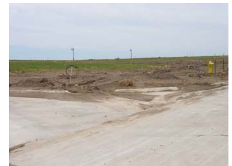
The impact of soil erosion and sedimentation is of great concern. Improper management of these sites can cause pollution to our resources.