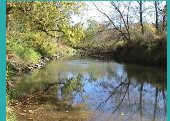
Walnut Creek Clive, Iowa