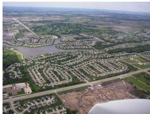
Storm water flows through storm drains into Iowa lakes, streams, and rivers.

Stormwater runoff is a major problem when it picks up garbage, debris, sediment, chemicals, automotive fluids, fertilizers, leaves and other pollutants from parking lots, yards, city streets, shopping malls, house roofs, etc. This type of pollution is called nonpoint source (NPS) pollution and is more of a problem than direct discharges from commercial industries and plants, which have NPDES (National Pollution Discharge Elimination System) permits as mandated by the U.S. Environmental Protection Agency. The result of unclean stormwater runoff discharges is the loss of fish and aquatic wildlife from the community's streams and creeks. The City must comply with the new State and Federal regulations related to stormwater runoff.