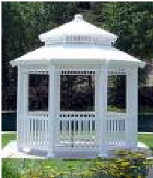
A permit and fee is required for all accessory buildings over 120 sq. ft.

Phone: 515-223-6221 Fax: 515-457-3091 www.cityofclive.com